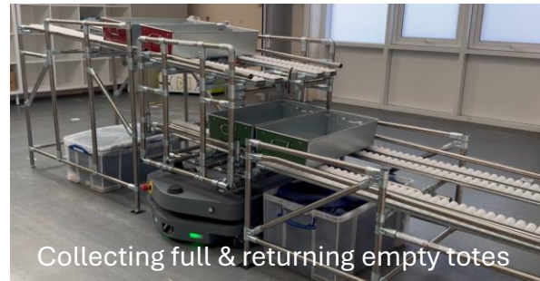
Collecting full & returning empty totes

An automation company that effectively provides Agency Robot workers . When Human and Robot workers collaborate, we create a more positive outcome .